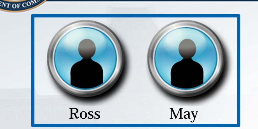
Illustration 1: Inventor v. Joint

"Inventor" or "Inventive Entity" or "Inventorship"