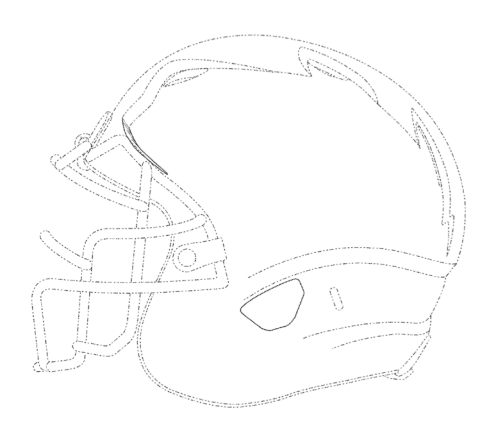
Pat. No. D753346