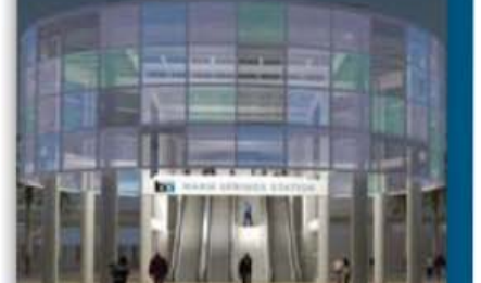
Warm Springs BART Station Rendering